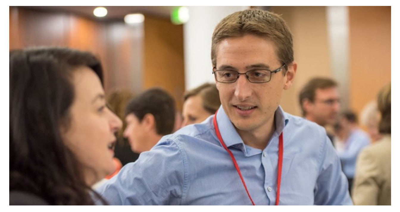
The ACEL New Voice Scholarships are awarded to education leaders whose work has made a significant impact in their field.

The scholarship recognises forward thinking, contextually relevant and responsive educational leaders whose work has had an impact above and beyond their immediate context.