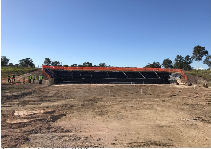
Piling preparation – Ground floor slab – 02.06.17