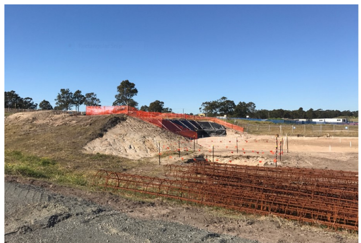
Groundworks and retaining wall preparation – 02.06.17