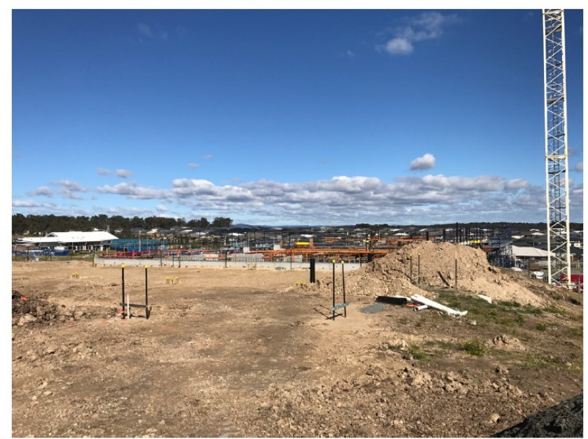
First floor slab detail cut and preparation – civic hub area – 04.08.17