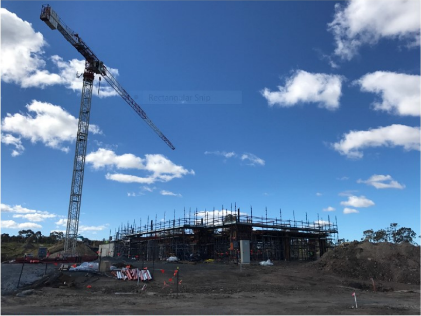
First floor slab formwork installation - Front plaza area - 04.08.17

Planning is also underway for the construction of an on-site flexible learning village which will act as a temporary school site until the first of four interconnected buildings is completed which is now scheduled for the start of Term 2 next year. Potential future delays, such as those caused by the unusually heavy Easter rains, will be minimised with building works now having progressed to a less weather dependent stage of the building works. The location of the large on-site building crane, which was not part of the original building scope of works, until the completion of the first building will continue to reduce the amount of lost time from the early earthworks part of the programme.