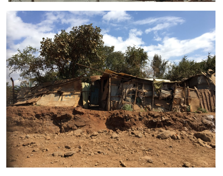
Some pictures of housing in one of the world's largest and most infamous slums, Kibera, which has a population of about one million people.