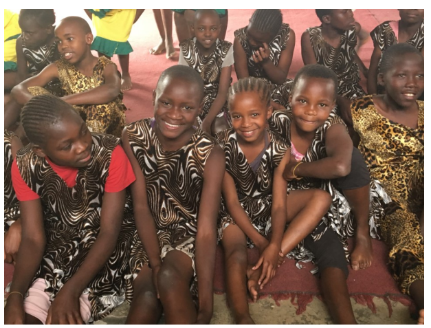
Some of the performers in the gymnastics performance team at the Ruben Centre which is a multi-purpose school in the slums of Mukuru in Nairobi.

The sheer joy when relationships are formed through multicultural exchanges. The children at the schools I visited in the slums are amongst the happiest, hard working and intelligent students that I have ever met. I want the same joy to be experienced by the broader community as we establish overseas partnerships .