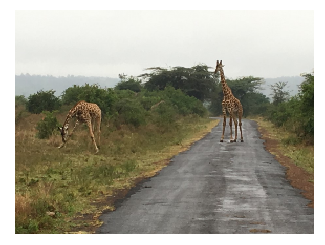
The beauty of Africa – Rift Valley (to the left), Nairobi National Park (to the right)