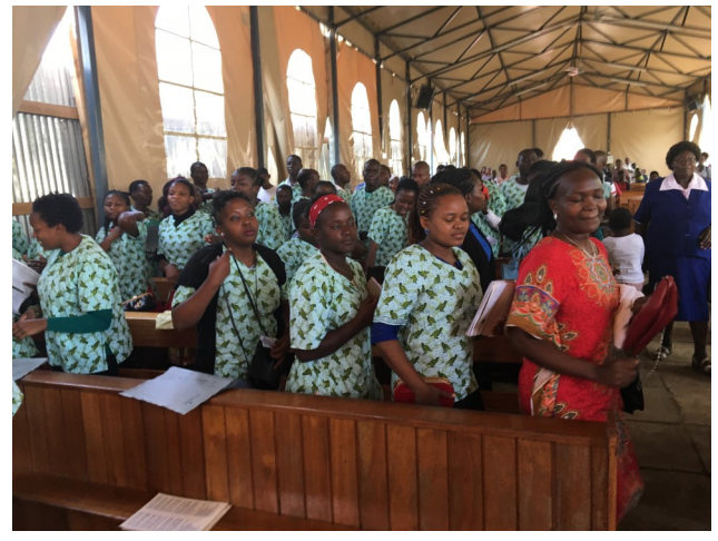
A vibrant Mass at the St Michael's Parish Nairobi with beautiful and enthusiastic singing from the local parishioners.